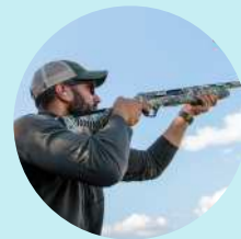
Trap Shooting Ranges