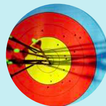
100 Meter Archery

Follow all range rules and determine a Shooting Marshal