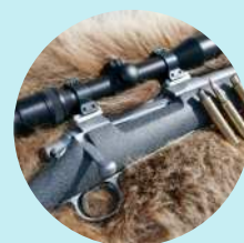
200 Yard Rifle Range